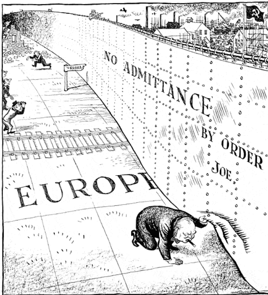
HUNGARIAN TROOPS TODAY BEGAN TO DISMANTLE A 350 km LONG "IRON CURTAIN"